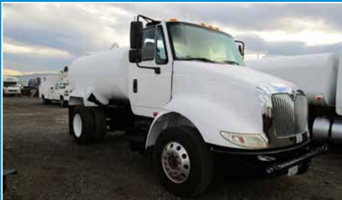
2014 International 8600 S/A Water Truck