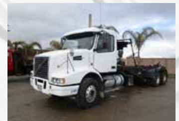
2008 Volvo VHD64B T/A Roll-Off Truck