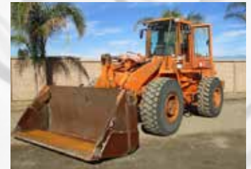
Case 821B Wheel Loader