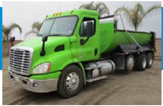
2013 Freightliner Cascadia Super-10 Dump Truck :: 1 of 2

Preview Dates :: 02.13.19 & 02.14.19 Preview Times :: 7:30 am-4:30 pm