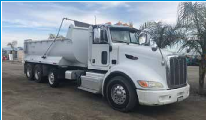
2012 Peterbilt 384 Super-10 Dump Truck :: 1 of 2