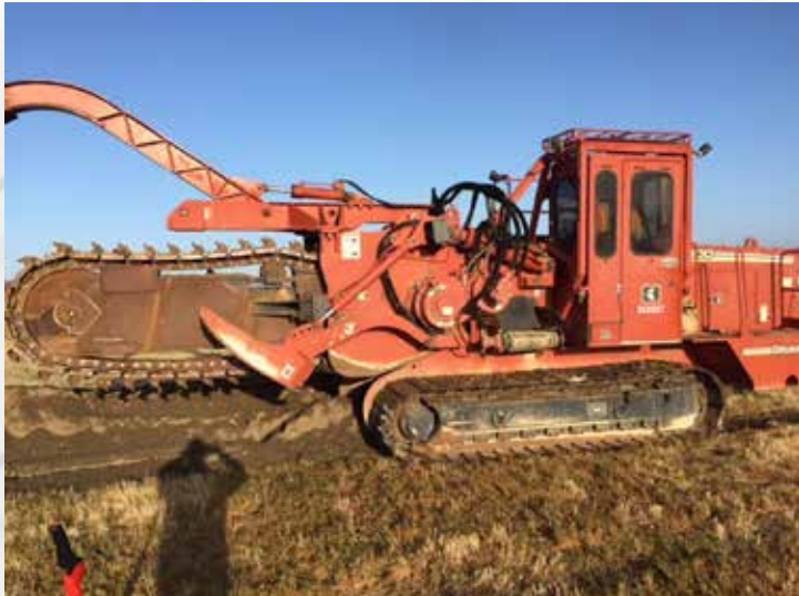
2008 Ditch Witch HT220 Trencher