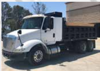
2011 International 8600 T/A Dump Truck