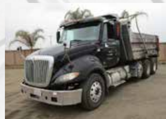
2009 International Prostar Super-10 Dump Truck