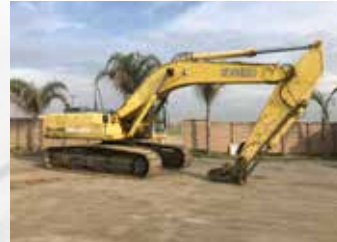
Kobelco SK330LC Hydraulic Excavator