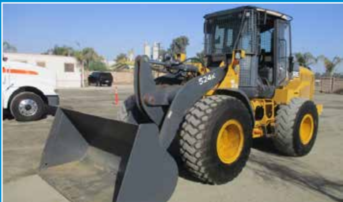
2013 John Deere 524K Wheel Loader