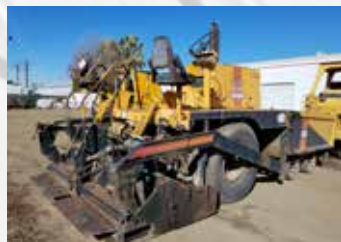
Blaw-Knox PF180H Asphalt Paving Machine