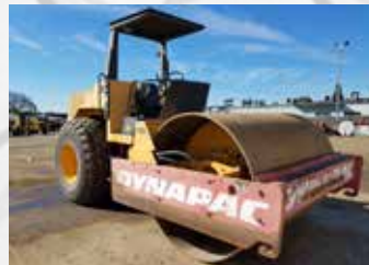
Dynapac CA251 Compaction Roller