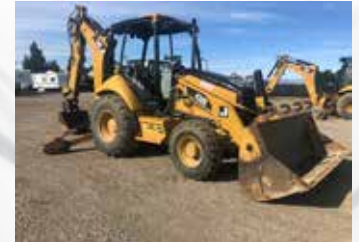
2008 Caterpillar 430E Loader Backhoe