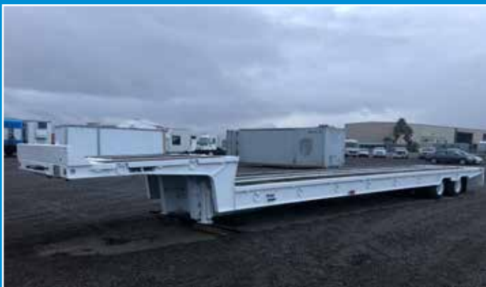
Trail King TK70SA Equipment Trailer