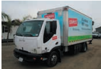
2010 Smith Newton S/A Van Truck :: 1 of 8