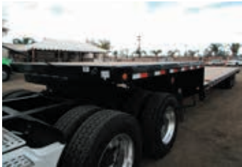
2017 PJ Trailer SD452 T/A Equipment Trailer