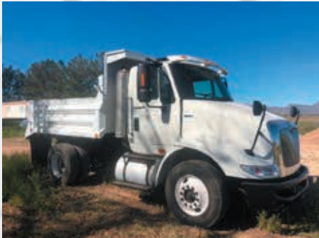
2013 International S/A Dump Truck

www.wca-online.com • 2021 Goetz Rd., Perris, CA 92570