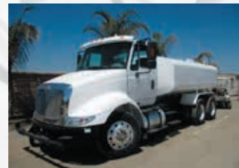
2012 International 8600 T/A 4000 Gallon Water Truck