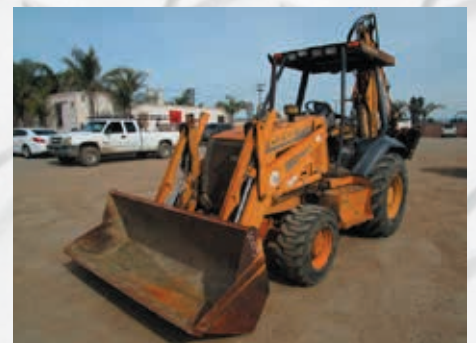
Case 580 Super L Loader Backhoe