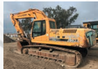
Hyundai 290LC-7 Hydraulic Excavator