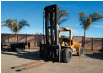
Hyster H300 Construction Forklift :: 1 of 2