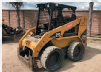
2006 Caterpillar 246B Skid Steer Loader