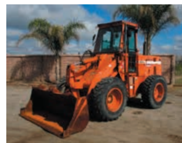
Dresser 510B Wheel Loader