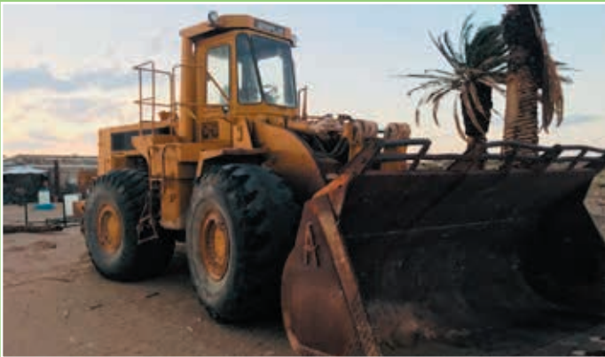
Caterpillar 980C Wheel Loader