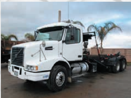
2008 Volvo VHD64B T/A Roll-Off Truck