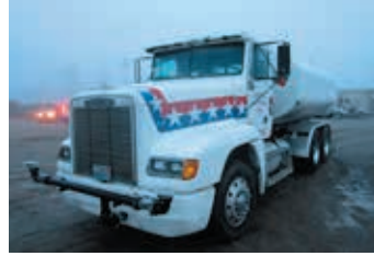
Freightliner FLD120 T/A 4000 Gallon Water Truck