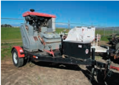
2006 Asphalt Zipper AZ300 Asphalt Profiler