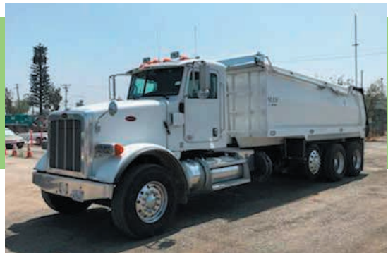
2013 Peterbilt 365 Stryker Super-10 Dump Truck

Preview Dates :: 04.17.19 & 04.18.19 Preview Times :: 7:30 am-4:30 pm