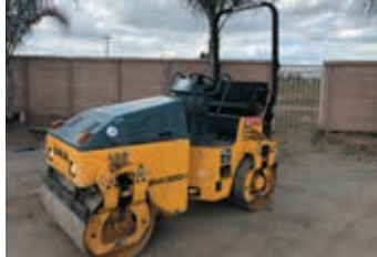
2010 Sakai SW320-1 Tandem Vibratory Roller