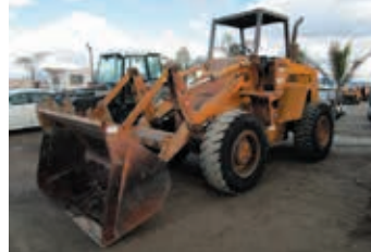
Case W20C Wheel Loader