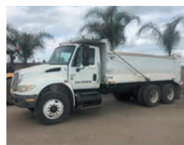
2006 International 4400 T/A Dump Truck