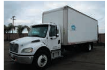
2008 Freightliner M2 S/A Van Truck