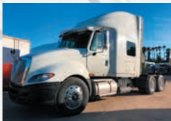
2011 International Prostar T/A Truck Tractor