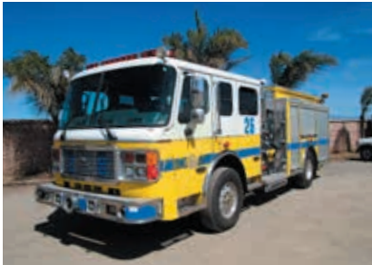
2011 American LaFrance Fire Truck