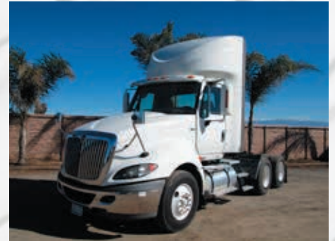
2011 International ProStar T/A Truck Tractor