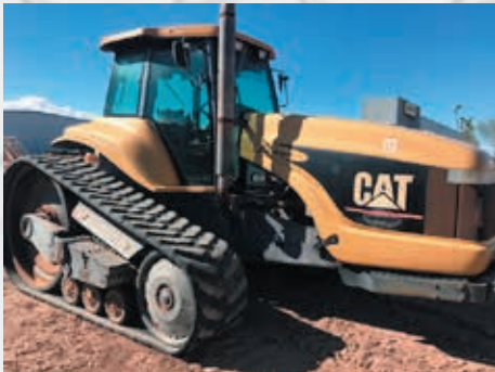
Caterpillar 45 Challenger Ag Tractor