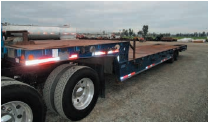
Trail King T/A Equipment Trailer