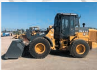
2013 John Deere 524K Wheel Loader