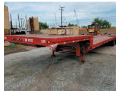
Aztec Tri-Axle Stepdeck Trailer