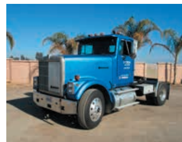
International 9300 S/A Truck Tractor