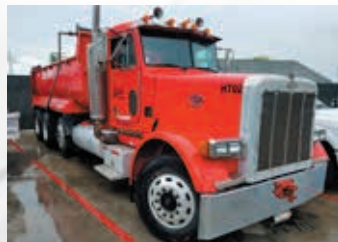
Peterbilt 379 Super-10 Dump Truck