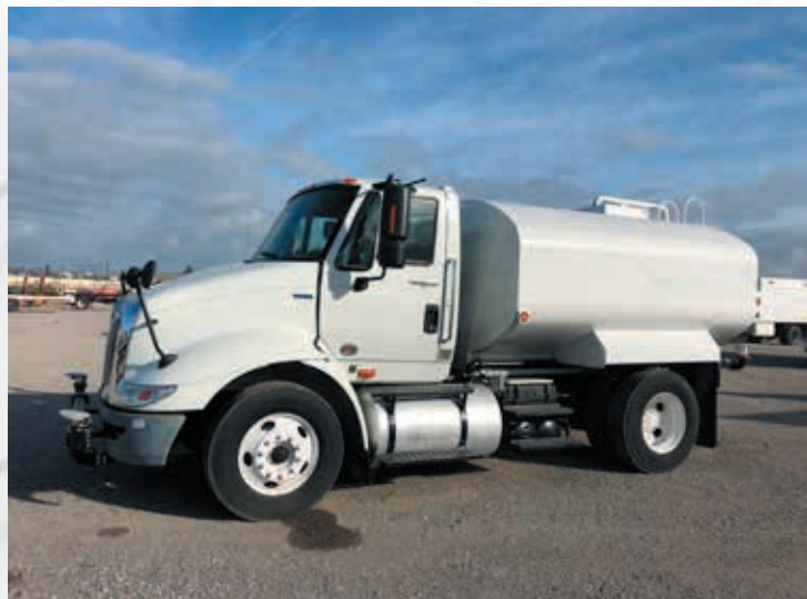
2012 International S/A 2500 Gallon Water Truck :: 1 of 3