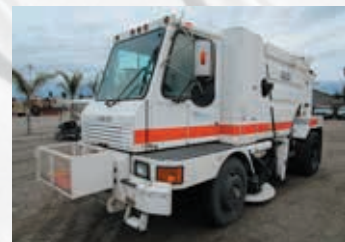
2006 Johnston 4000 S/A Sweeper Truck