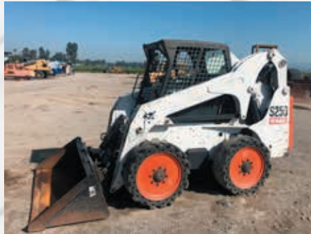
2008 Bobcat S250 Skid Steer Loader