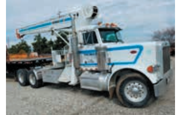
Peterbilt 379 T/A Truck Tractor

Trail King T/A Equipment Trailer , 32' Deck, 9' Top Deck, Dove Tail, Winch, 25-Ton Capacity, S/N: 1TKA04227MM028587