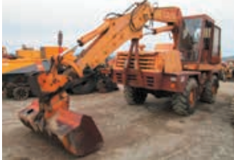
Case 1085E Wheel Excavator