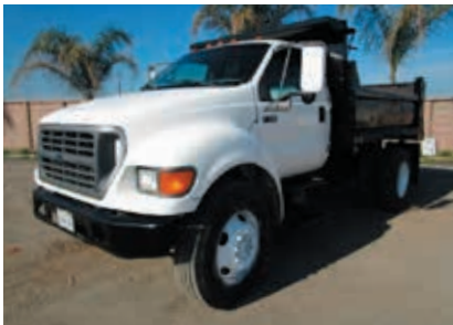
2000 Ford F750XL S/A Dump Truck