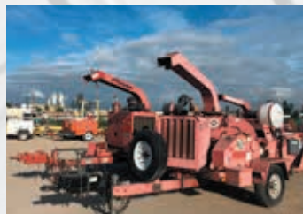
Morbark Portable Chippers :: 1 of 3