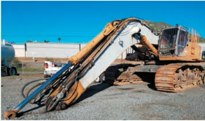
2002 Case CX800 Hydraulic Excavator