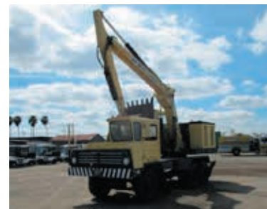
Hein-Werner T12HD Wheeled Excavator Truck

Dresser Pump Company Large Pump , 1,800 GPM, S/N: 96-B092906-2