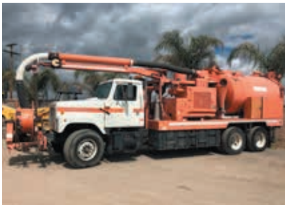
2001 International 2574 T/A Vacuum Truck