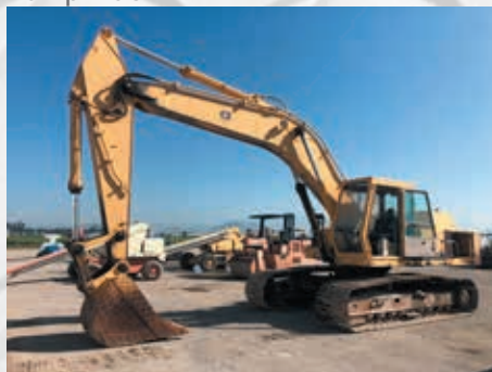
John Deere 792 Hydraulic Excavator