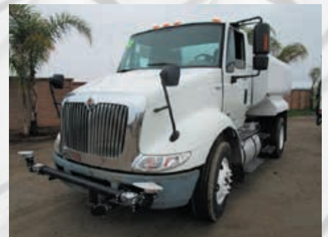
2014 International 8600 S/A Water Truck