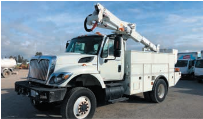
2008 International 7300 Workstar S/A Bucket Truck