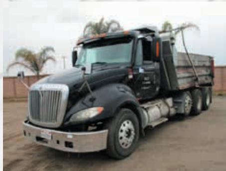
2009 International Prostar Super-10 Dump Truck